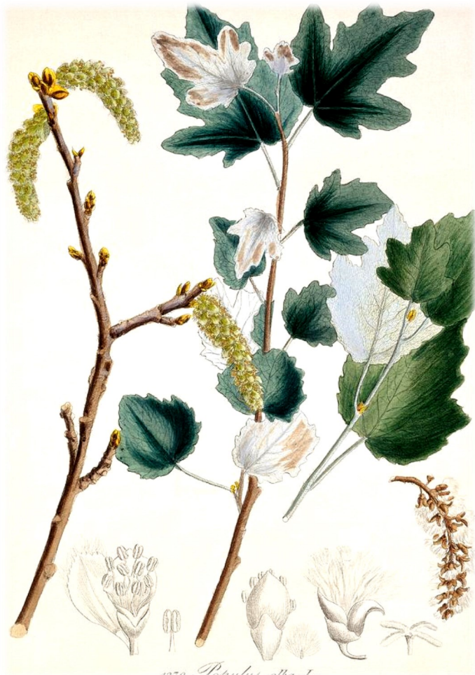
1270. Populus alba L.